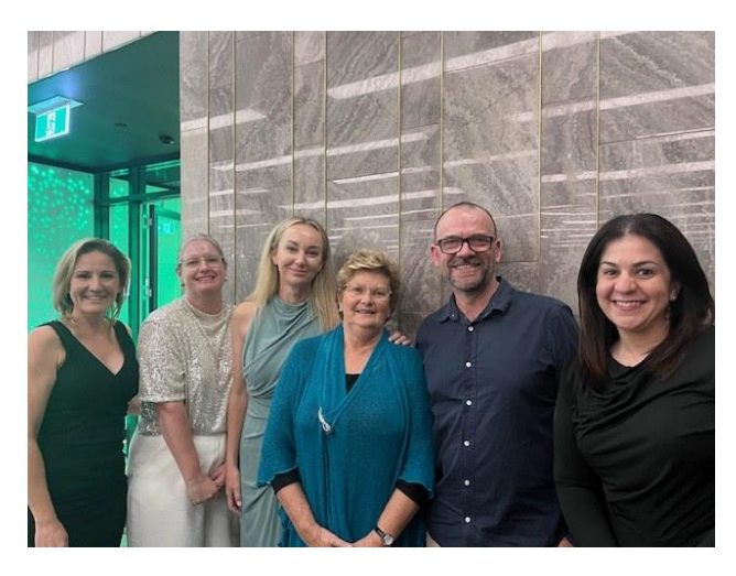
1 - Congratulations to our amazing nominees!