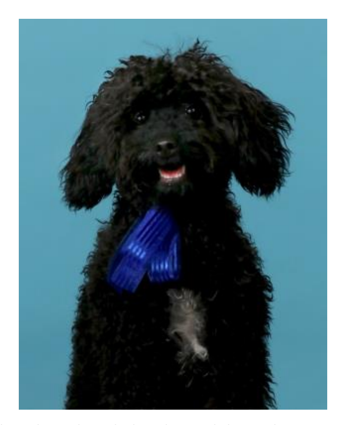
Luna\ has\ been\ busy\ helping\ the\ students\ do\ their\ class\ work\ this\ week.