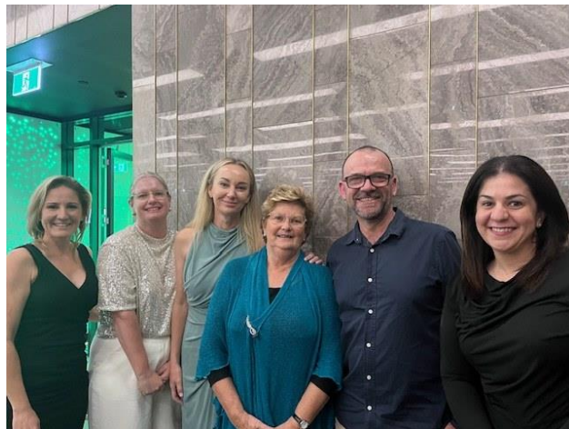
1 - Congratulations to our amazing nominees!