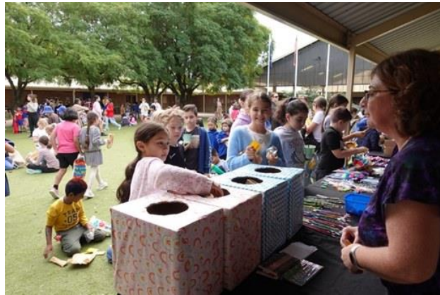
2 - Students trying their luck at the P&F Lucky Dip stall!

Thank you to all our volunteers, students and staff that made Sacred Heart Feast Day a wonderful day for our students. All money raised on Sacred Heart Feast Day goes to the following charities: Life Link, Catholic Missions, Caritas, the Loretto Missions and St Vincent de Paul.