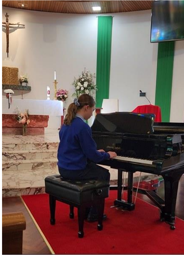
7 - India performing 'Dance of the Gnomes' by C. Almonte