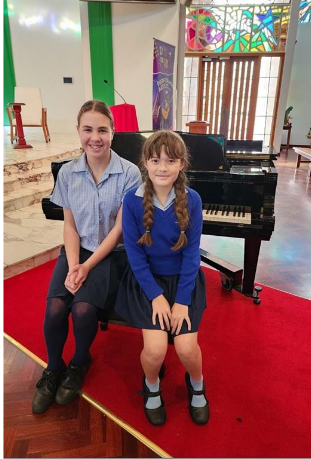
9 - India and Faith