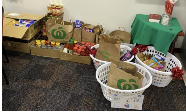
2 - Food and toiletries donated by Sacred Heart staff