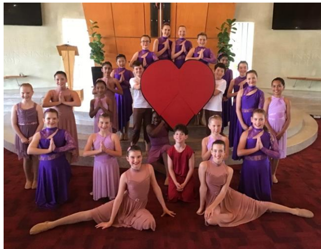
1 - The Hearts Liturgical Troupe - Year 5 and 6

Item: Jesus, Healer of the Broken Hearted